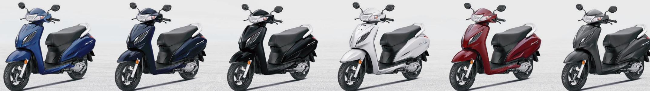
Decent Blue Metallic